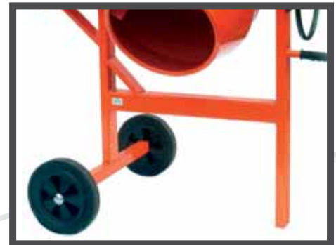
HEAVY DUTY STAND