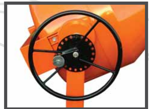
WHEEL MECHANISM FOR ADDED CONTROL